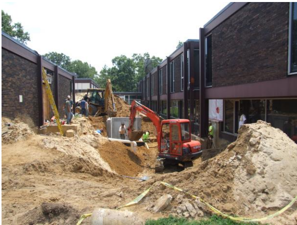
Photos: Before & After Photos Academic & Administration Building Renovations